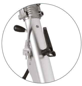
VISPA 35 E The practical hook can be used as cable clamp when the machine is operating or, otherwise, as cable holder (on request, 15 m extension cable is also available as optional extra).