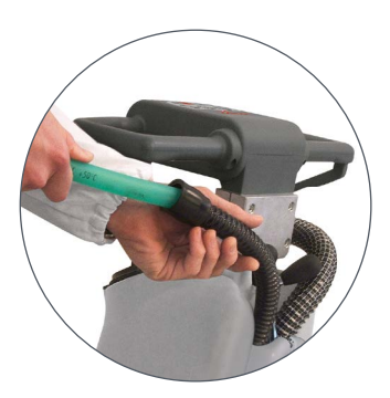
VISPA 35 B-BS Periodic cleaning of the squeegee hose to ensure efficient suction.