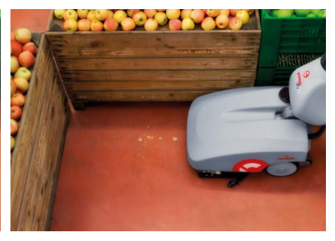
Vispa 35 is ideal for accurate cleaning of room corners and to operate in congested areas thanks to its handle bar which ensures 180° flexibility and to its compact size that is shaped around the brush head.

Vispa 35 B-BS is perfect for cleaning highly congested areas and its long run time is ensured by easy battery replacement and best machine efficiency over several cleaning sessions. Furthermore, excellent run time is also ensured by tank capacity. The mains-powered version is ideal for cleaning small areas without too many obstacles.