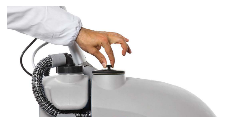
The relief valve on the solution tank cap ensures constant water outflow on the floor.