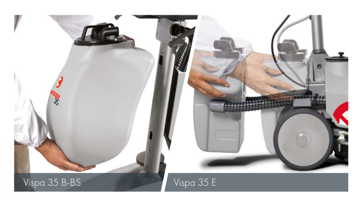
Dirt is collected in the recovery tank which is easily removed for effortless emptying.

Thanks to the combined action of the suction motor and the squeegee swinging around the brush, perfect drying is ensured also on bends.