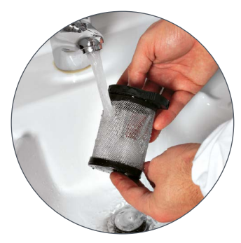
VISPA 35 E-B-BS Simple and practical thorough cleaning of the suction filter.

Thanks to quick cleaning procedures at the end of the day, perfect machine efficiency is ensured over time.